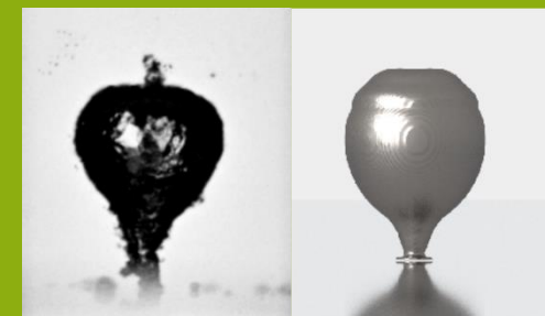
Single bubble collapse near the wall: Experiment (left) and simulation (right).