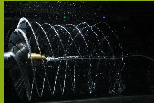
Tip and hub vortex cavitation on a ship's propeller.