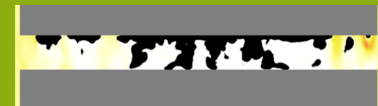
Erosion topography on the head and cavitation structures in the gap of a sonotrode.